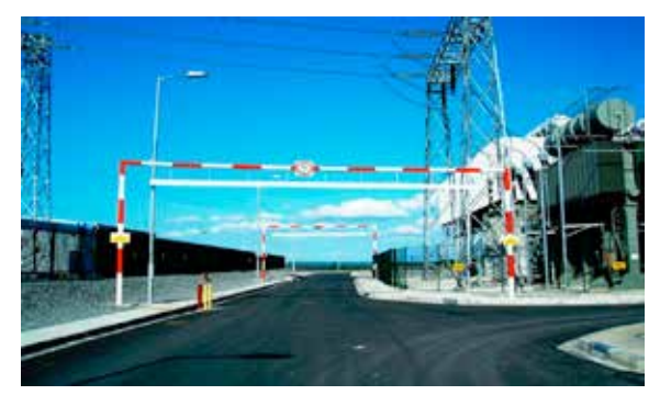
Typical example of height restriction barriers in place

(d) Consider a Permit to Work which documents the control measures implemented to protect the asset and people.