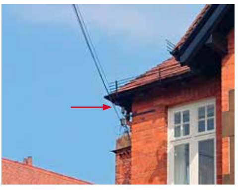
Overhead power line connected to domestic property