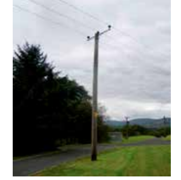
11kV Distribution Line HV Conductors generally horizontal