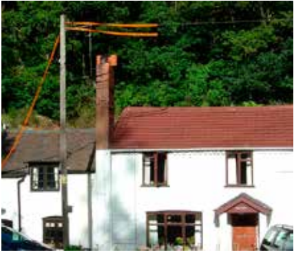
Overhead power lines made safe with shrouding